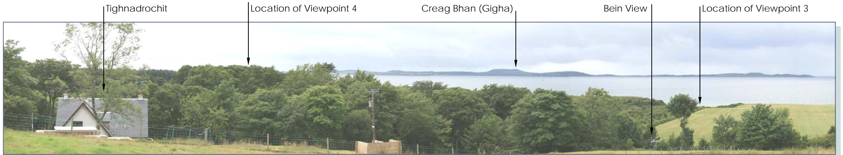
Viewing Distance - 242mm