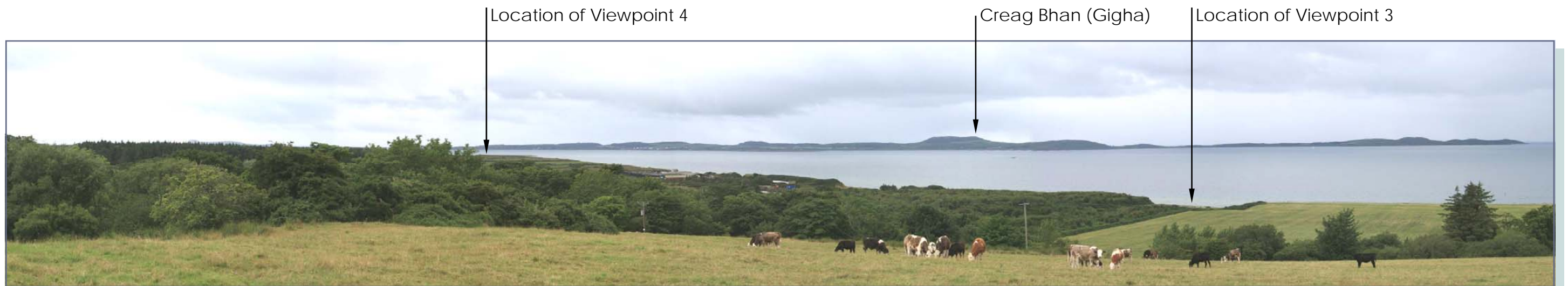
Viewing Distance - 242mm